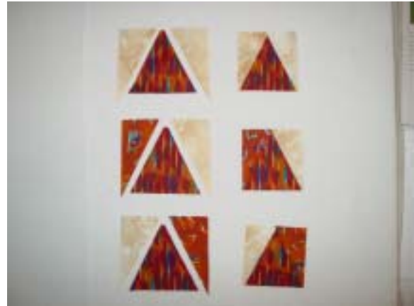
4" Finished size