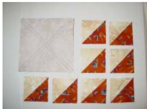
4" Finished size