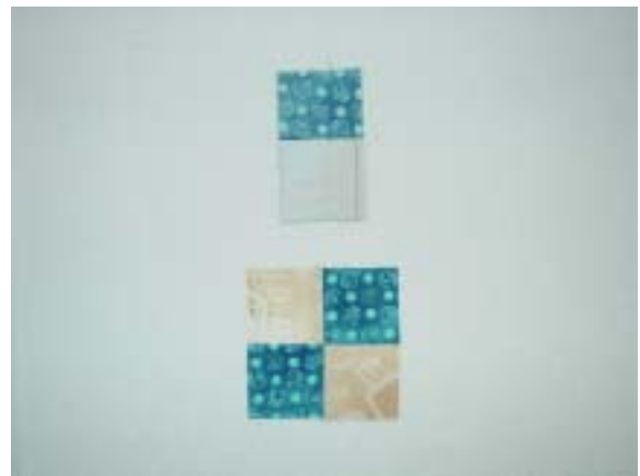
4" Finished size