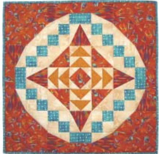
Finished size 28" x 28"