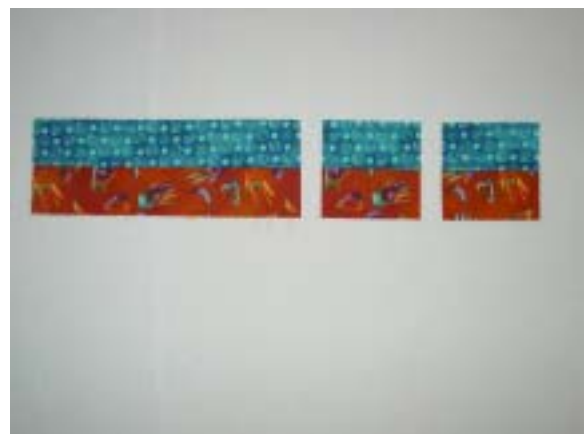
4" Finished size